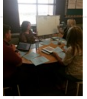
Teachers collaborate to help students

Deerfield Elementary is an amazing place to be, thanks to our fantastic students, parents, faculty, and staff!! Great things are happening everyday at Deerfield! ~Caroline Knadler, Principal