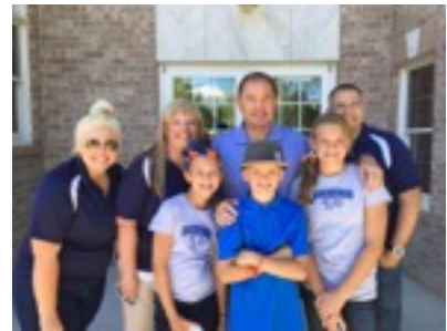
Our Student Council with Governor Herbert at the Cedar Hills Parade

Science Resources & Assembly: Teachers were able to purchase materials to make science more hands-on. We also used funds to pay for an interactive and engaging science assembly for the entire school.