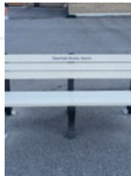
The Buddy Bench is a new addition to the playground.