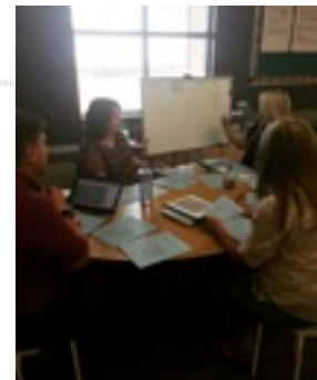
Teachers collaborate to help students

Deerfield Elementary is an amazing place to be, thanks to our fantastic students, parents, faculty, and staff!! Great things are happening everyday at Deerfield!