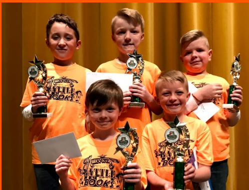
3rd Grade Winners!