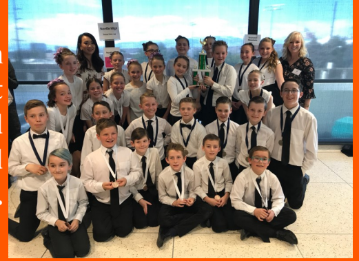
Ballroom competed at BYU and won 2nd place overall.