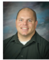
Cowley 6 th Grade