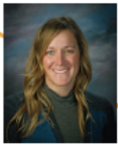
Payne Learning Lab