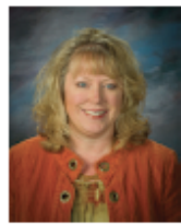
Mendenhall 6 th Grade