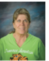
Stumpfenhaus Lunch Worker