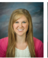
Swanson 2 nd Grade