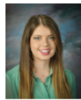
Funk 3 rd Grade