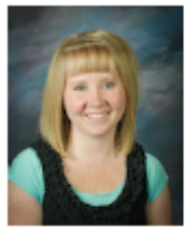
Chipman 1 st Grade