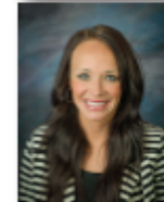
Sally Yates Membership