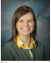
Henderson Learning Lab