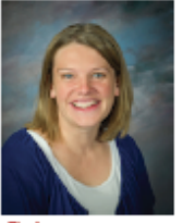
Grimes 1 st Grade