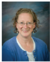
Ahlstrom 1 st Grade