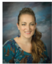
Moschetti 3 rd Grade