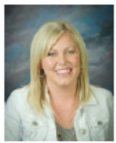
Schauerhamer 5 th Grade