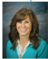
Murdoch 2 nd Grade