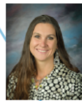
Fairchild Teacher Aide