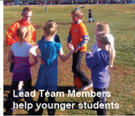
Lead Team Members help younger students