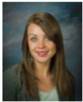
Mangum 3 rd Grade