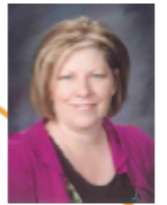
Hoggan Lunch Worker