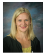
Thorpe 1 st Grade