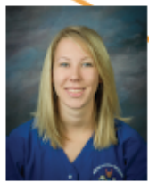
Payne Lunch Worker