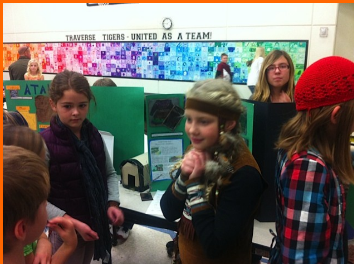
5th Grade students show their Native American displays.