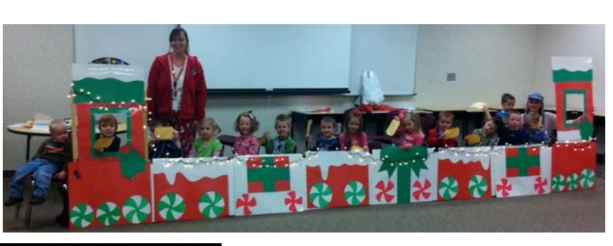
RIGHT: Our Preschool class enjoyed jumping on the Polar Express train during a fun activity.