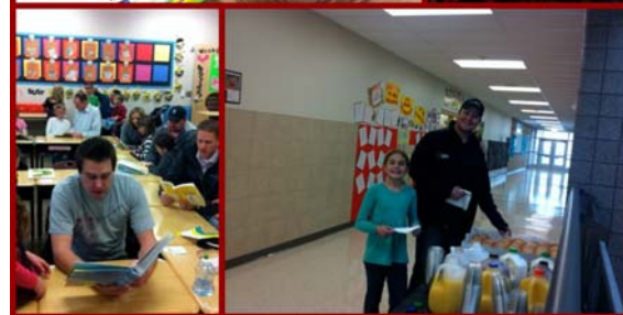
LEFT: 3rd/4th Grade Breakfast of Champions