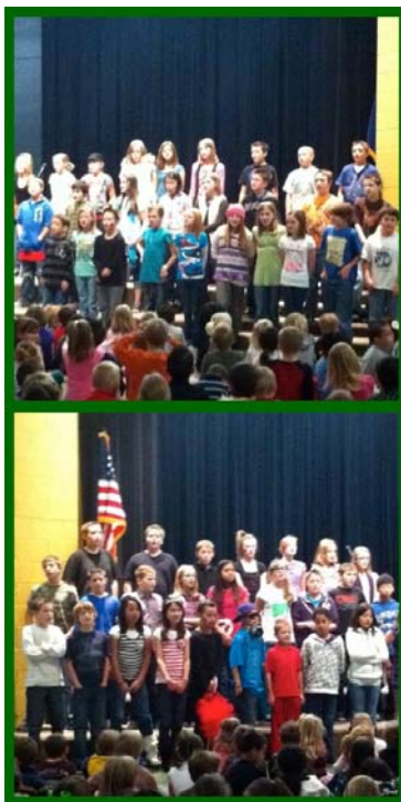
RIGHT: 6th Grade Pillow Concert