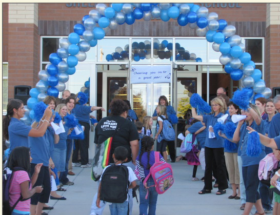
A cheering welcome on the first day of school.