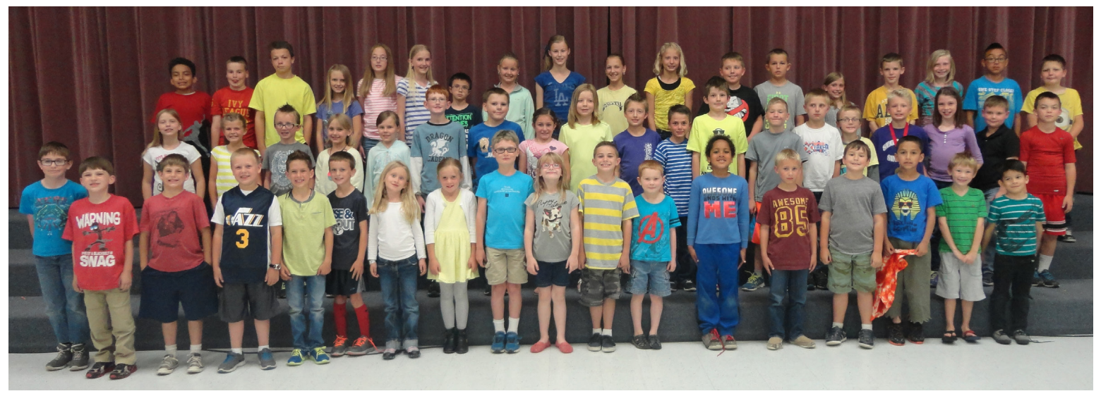
Congratulations to our Students of the Month! Special thanks to Del Taco , Chick-fil-A , Applebee's , Pizza Pie Café , and Classic Fun Center for helping us recognize our students' accomplishments.