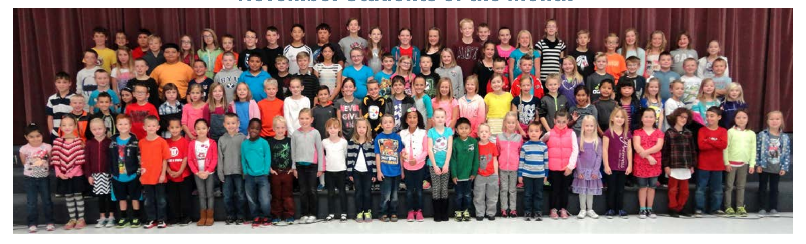
Congratulations to our Students of the Month! Special thanks to Del Taco , Chick-fil-A , Applebee's , Pizza Pie Café , and Classic Fun Center for helping us recognize our students' accomplishments.