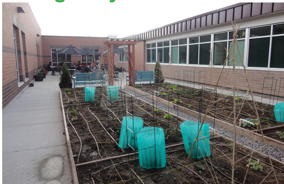
Late spring 2014: Students planted flowers, topiary trees, vegetable garden, and Clematis.