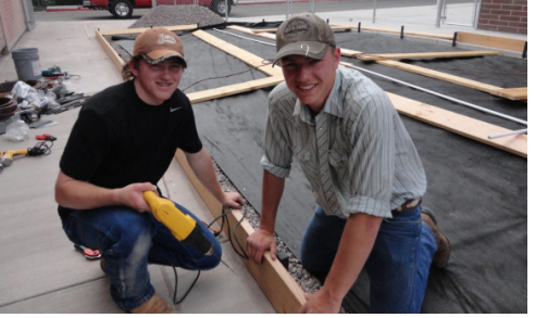
From the Beginning

Spring 2013: Lehi High School Agricultural Club built the grow boxes.