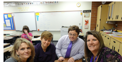
Teachers making a difference through PLC's

I have been impressed with the level of teacher commitment towards this process. Teachers collectively analyze student data and respond to the Four Essential Questions.