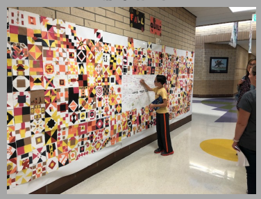
Specialty Teachers Integrating Core Curriculum (art display using figurative language)