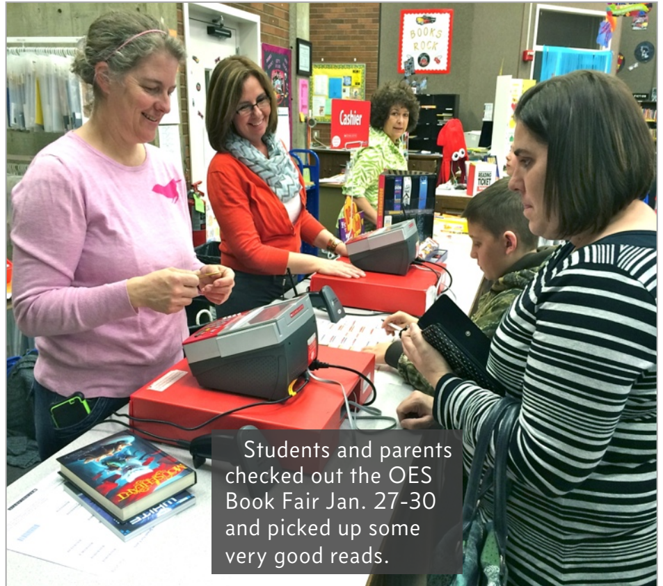
Students and parents checked out the OES Book Fair Jan. 27-30 and picked up some very good reads.

Make it a great day—or not. The choice is yours.