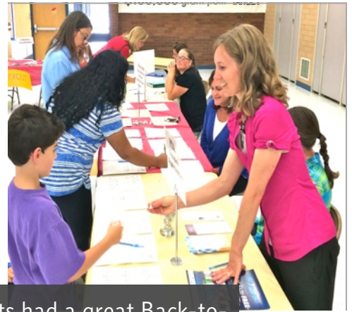
OES Cubs and parents had a great Back-to-School Night and first day of school.