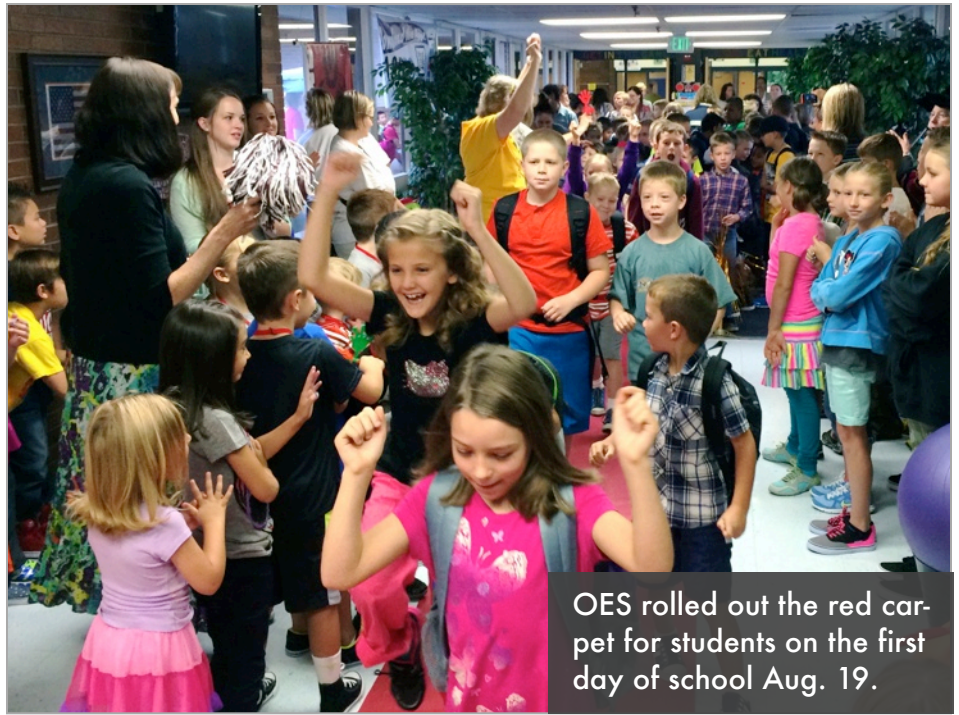
OES rolled out the red carpet for students on the first day of school Aug. 19.

Make it a great day—or not. The choice is yours.