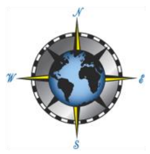
Pointing the way to the Future