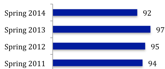
Legacy Writing Assessment 2013-14 percent of students at benchmark

Goal: Increase student writing levels as measured by school-level writing rubrics. Evaluate current rubrics to align with more rigorous Utah Core Standards.