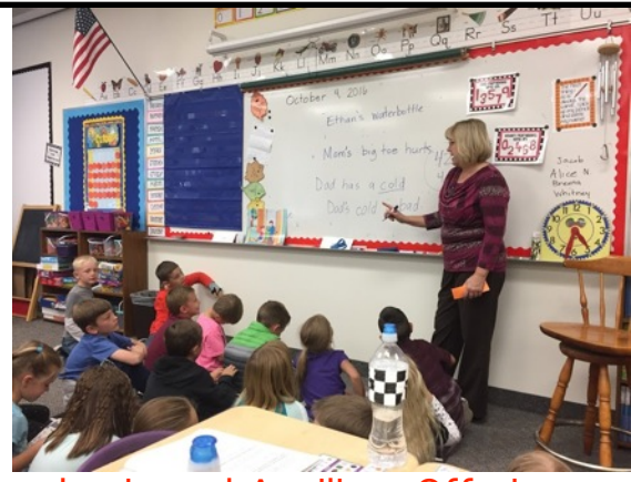
Academic and Auxiliary Offerings: