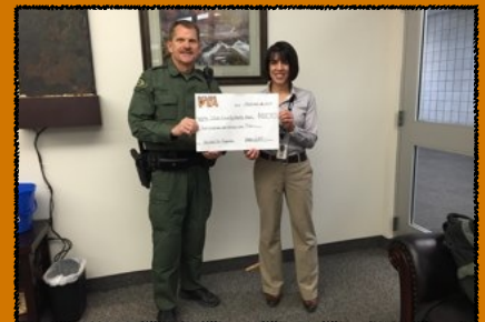
Thank you Black Ridge students for donating to "Pennies for Puppies" to support the Utah County Sheriff's Department drug dog program.