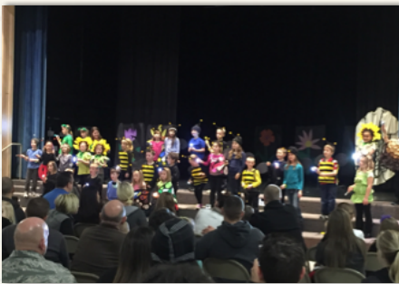
Our 2nd grade students "Glow" in their program.