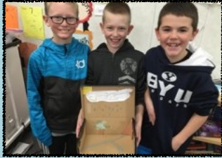
A model of the water cycle.