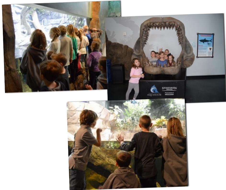
Our students went to the aquarium and had a great time learning about the animals and their habitats.