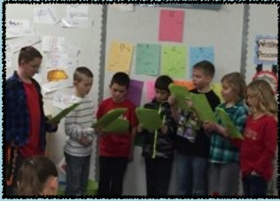
Readers' theater in 4th grade