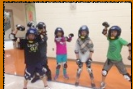
Our 5th graders just finished RAD Kids, thanks to our 5th grade teachers and our awesome RAD Kids volunteers.