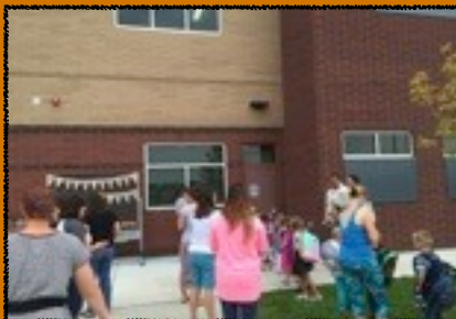
First Day of Kindergarten